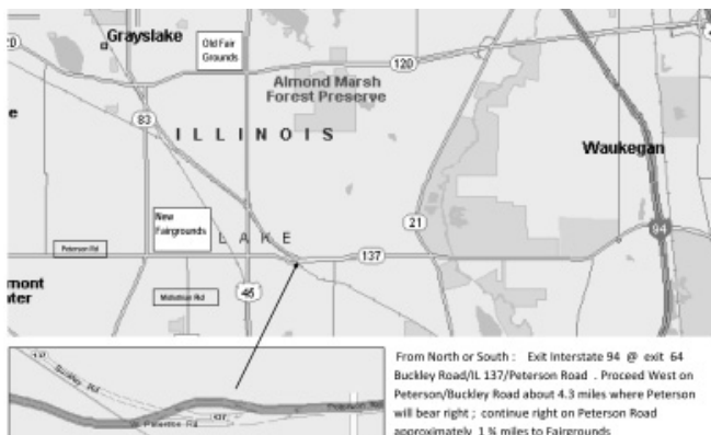
From North or South : Exit Interstate 94 @ exit 64 Buckley Road/IL 137/Peterson Road . Proceed West on Peterson/Buckley Road about 4.3 miles where Peterson will bear right ; continue right on Peterson Road approximately 1 1/2 miles to Fairgrounds